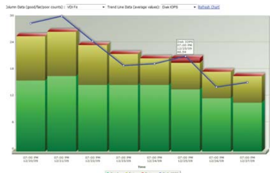
VDI User Experience & Disk IOPS Green Good • Yellow Fair • Red Poor

Liquidware Labs certified partners can guide and work side-by-side with you every step of the way.